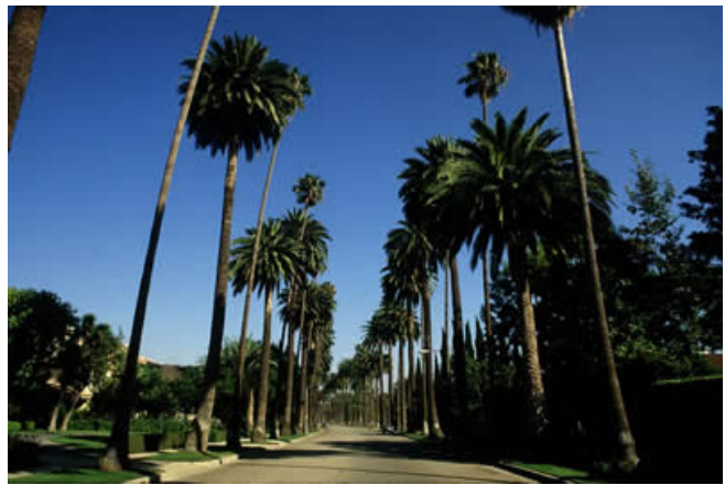
and Eastern Nebraska