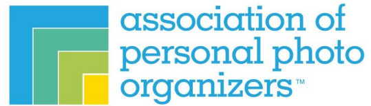
Photo Organizing Conference