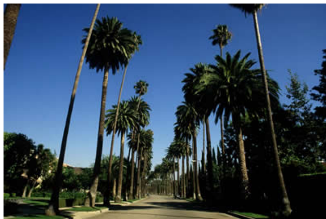
and Eastern Nebraska